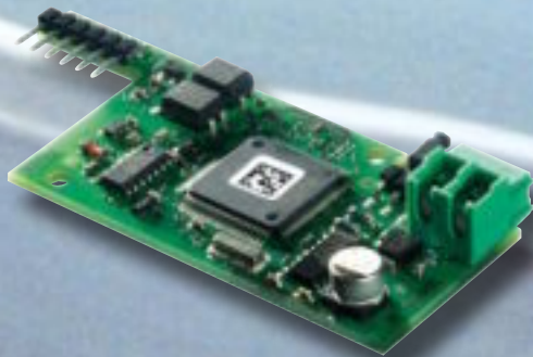
Communications modules can be added at any time

A security package enables early detection of tampering and possible problems with the system. For example, the ULTRAHEAT UH 50 records and signals incipient soiling in the system and offers effective tampering detection on the temperature sensors. The undeletable logbook as a standard feature rounds off this function perfectly. Monthly values also make consumption and measurement values plausible and traceable.